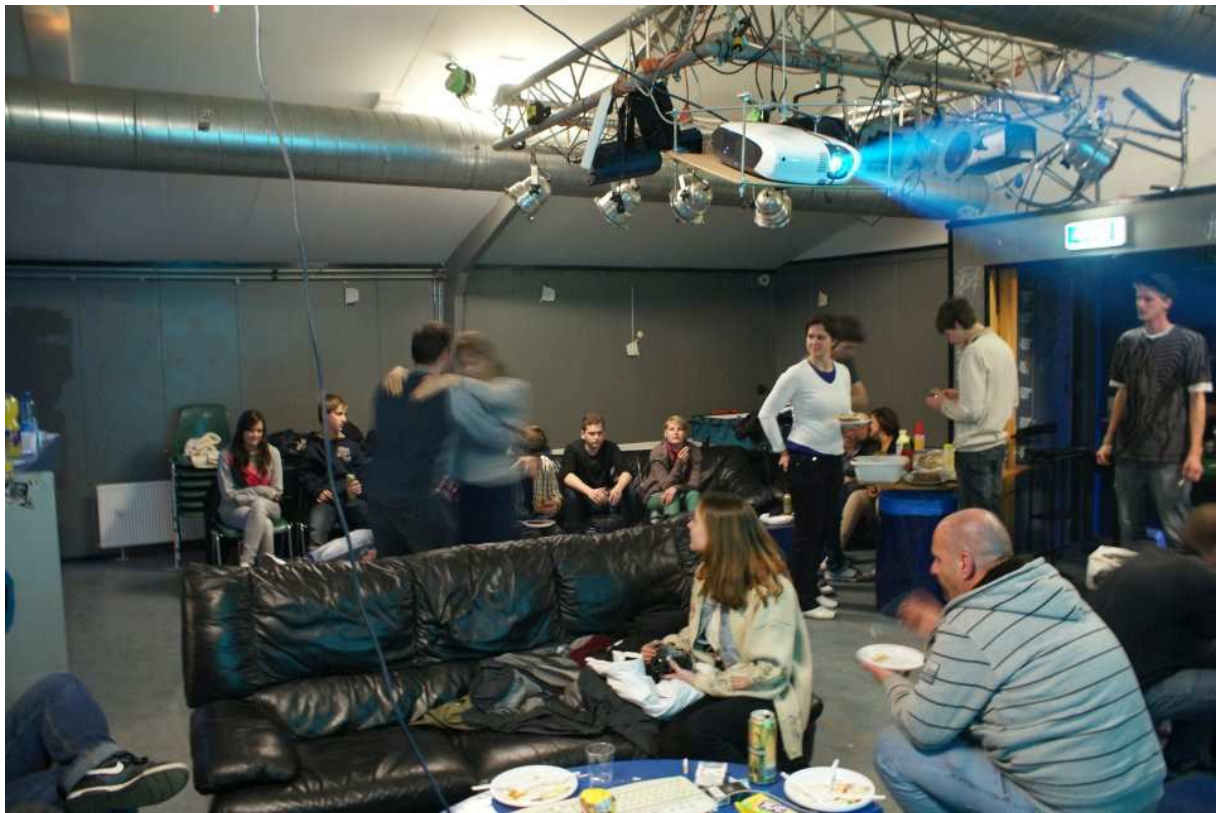
International youth exchange april 2012

Examples for activities are a Halloween Haunted House for teenagers, skate events and the first international youth exchange of the SWH.